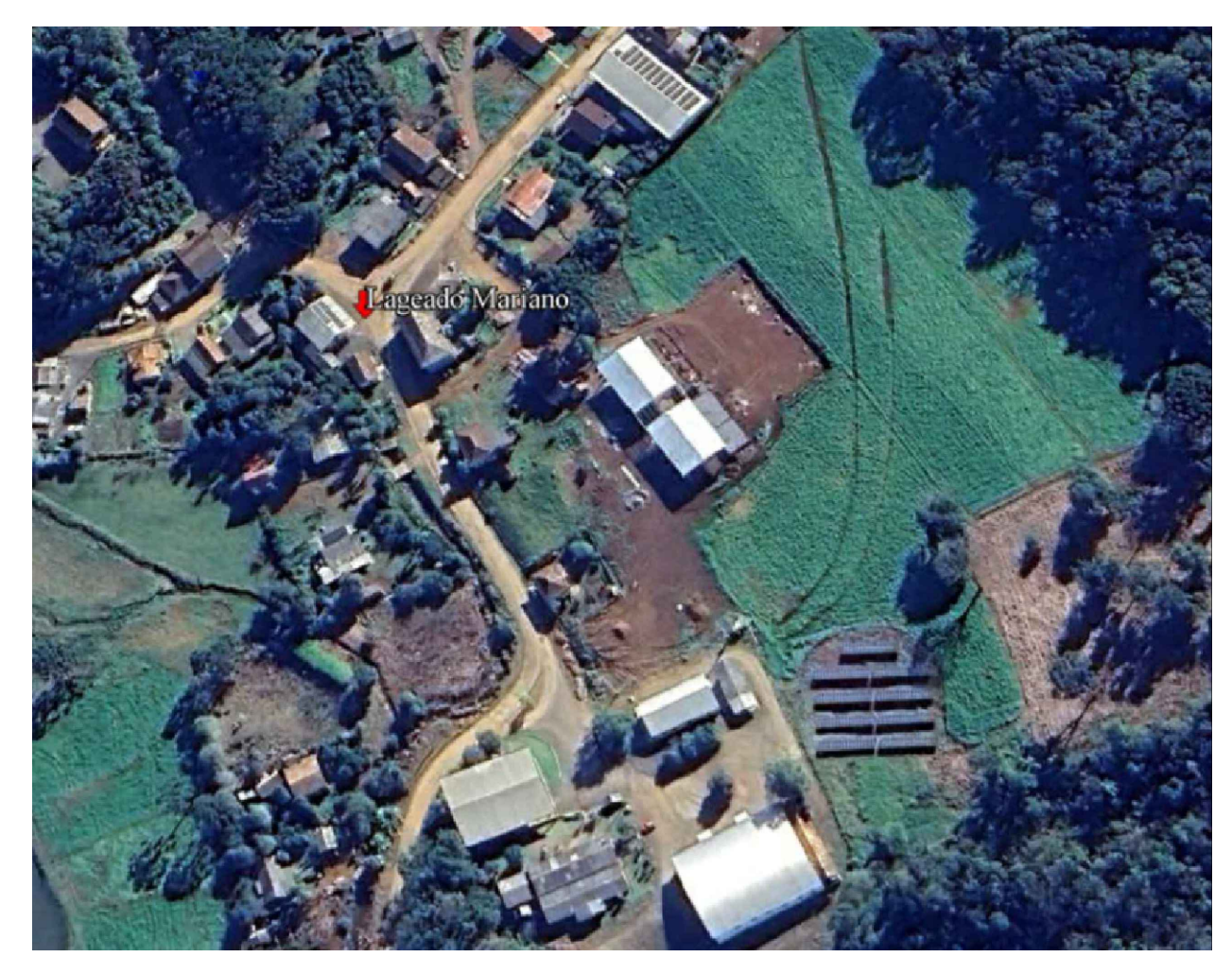
PLANTA DE LOCALIZAÇÃO ESCALA: RELATIVA